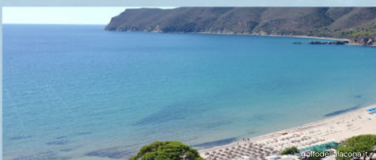
Secca del Frate